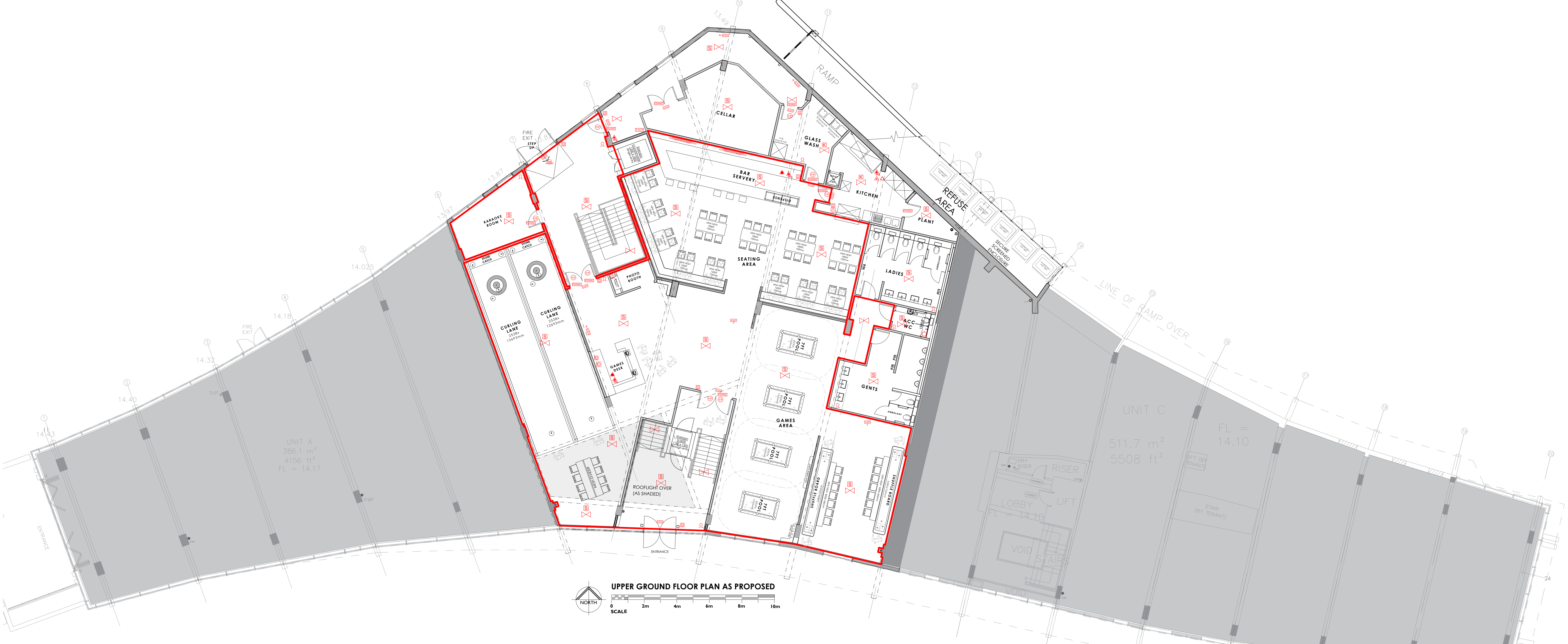
UPPER GROUND FLOOR PLAN AS PROPOSED

"Copyright in this drawing remains with the designer. Responsibility is not accepted for errors made by others in scaling from this drawing. All construction information should be taken from figured dimensions only. Check all dimensions on site. In case of any discrepancy, refer query to the designer."