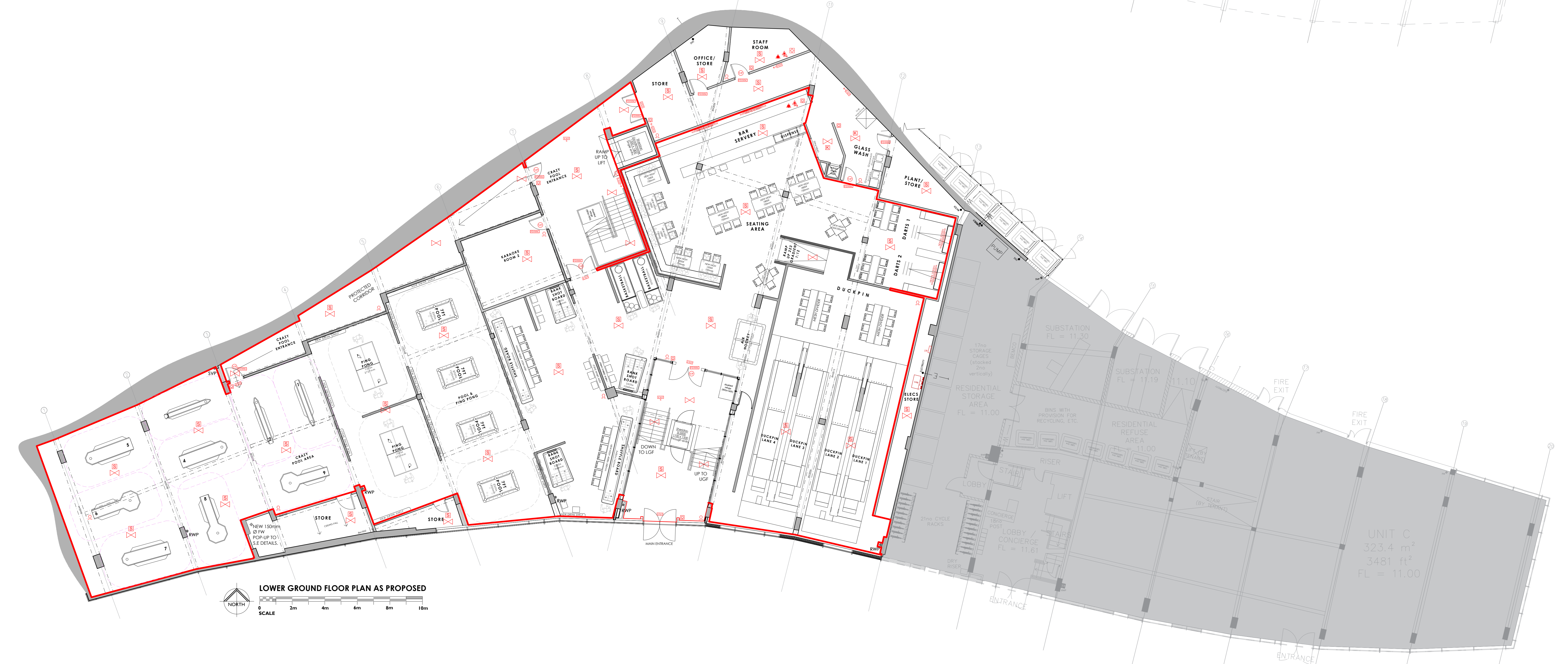
LOWER GROUND FLOOR PLAN AS PROPOSED